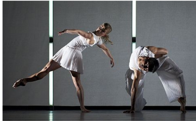
First published on 20 Oct 2011. Updated on 20 Oct 2011.

Sydney Dance Company's latest gets a 'yes' from us