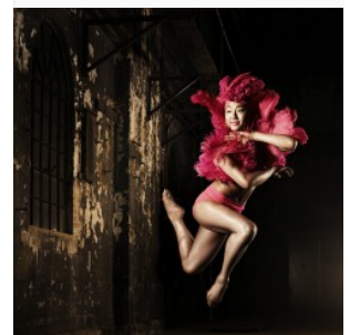
Sydney Dance Company